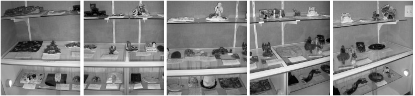
Pictured across these five photos are the items, created out of clay by 7th graders, representing the planet and human history from the beginning through 2012.