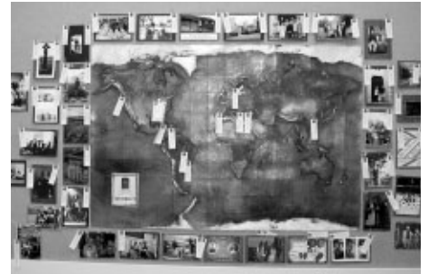
Black and white does not do this colorful Heritage Map justice! An interactive component of moving ones own tag from a photo to the corresponding map pin made it fun as well as beautiful.

After the morning program, it was about visiting the kids in their regular school routine, in the classrooms, at Activities, and for free time, play, and lunch. This was a favorite part of the day for many students, teachers, and special friends, because the children were able to show what they love about the school, where they like to play, and what they like to