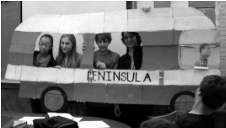
Eighth graders researching class bus & camping trips decided to create this replica of "Big Bertha" to use in a reenactment movie they filmed, inspired by the stories they heard while interviewing alumni.