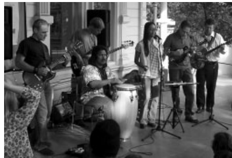
Many members of the Peninsula Parents Band and fellow parent musicians playing live music for this year's 'Band Together' Annual Giving Campaign kick-off. Yet another example of Peninsula parent initiative.

IN THE DEVELOPMENT, alumni and archives office at Peninsula we are lucky enough to hear amazing stories from alumni, former staff, and PALS (Parents of Alumni Students), as well as our current families. These are accounts of how the school has affected their lives and why it is important to each individual. I love what Peninsula offers to its students and families, and am heartened to find it has been providing that for decades, since its founding in 1925. The staff are always working to support the magic that still occurs seamlessly everyday; the joyous childhood, love of learning, and continued community building. I know all our families support this too, but