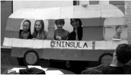
Eighth graders researching class bus & camping trips decided to create this replica of "Big Bertha" to use in a reenactment movie they filmed, inspired by the stories they heard while interviewing alumni.