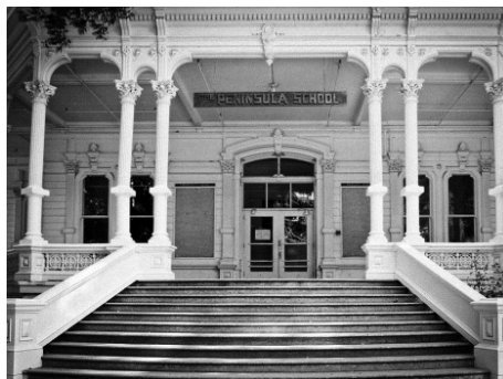
Peninsula School's timeless Big Building as photographed by Stefan Baerle.

DREAMS SIT AT THE HEART of almost every triumphant moment, every great discovery, every humanitarian vision, every epic journey. Cultivated properly, dreams become our roadmap to realizing and expressing the best and most beautiful parts of ourselves.